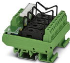
VARIOFACE module, for 4 plug-in miniature relays or miniature optocouplers, with LED, 24 V AC/DC input voltage

Please be informed that the data shown in this PDF Document is generated from our Online Catalog. Please find the complete data in the user's documentation. Our General Terms of Use for Downloads are valid ( http://phoenixcontact.com/download )