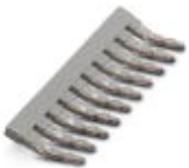
Insertion bridge, Number of positions: 10, Color: gray